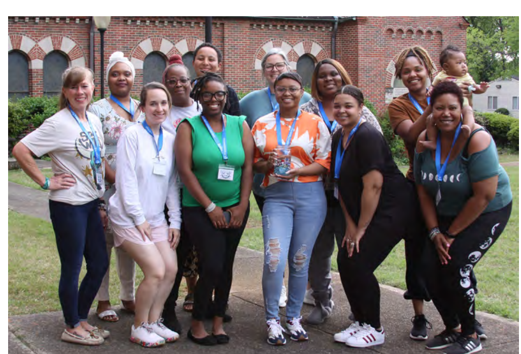
April 2023 Doula Workshop Participants

BirthWell is working diligently to both grow and sustain a doula workforce able to competently and compassionately serve a variety of families. In 2022-23, we started offering free "refresher classes" open to any doula who has attended a BirthWell doula training workshop, monthly book club meetings to discuss required reading for certification, and supplemental trainings on specific topics to better prepare doulas working with clients who may be HIV+ or in recovery from substance use disorder.